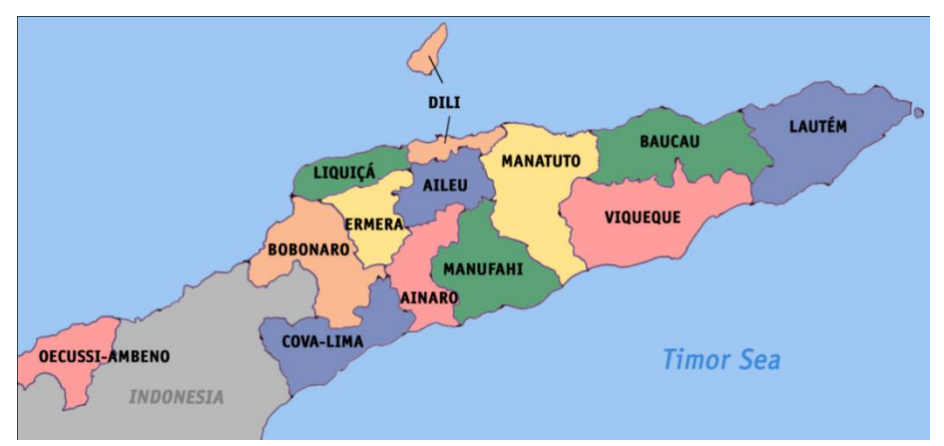
Figure 4. Administrative Region Map

Timor Leste has Dili city as the capital, located in the north coast. The whole country, of 15,420 sq.km large, is devided into 13 Districts, and each district is organized into several subdistricts. One district, Oecussi-Ambeno is located faraway in the west, separated by Indonesian territory. The main small island north of Dili, Atauro island, administratively is included as Dili city territory.