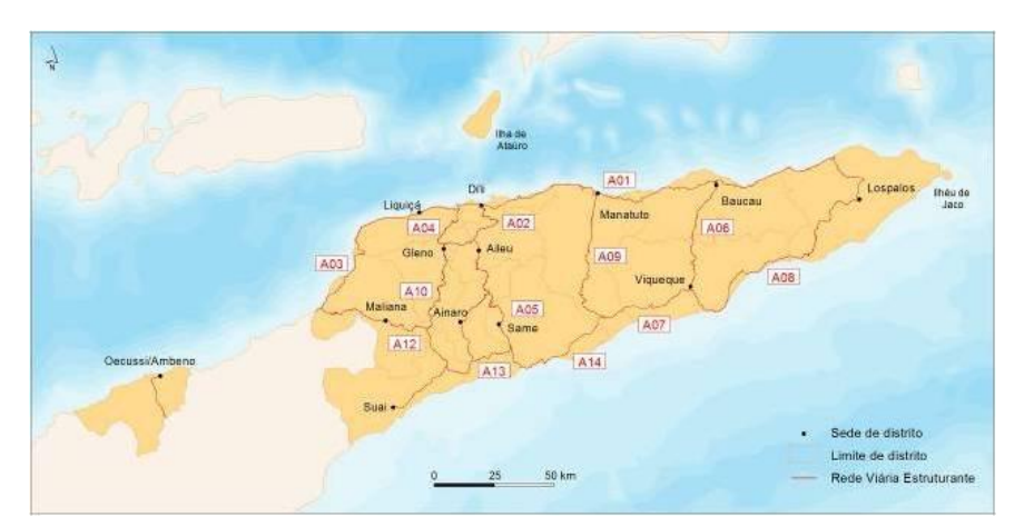
Figure 5. Timor Leste National Road Network

Timor Leste is very small country. So domestic transport is serve only by road transport. Even the capital, with a population of around 300.000, does not need other then road transport (GHD 2015). The main road network is presented in Figure 4 below.