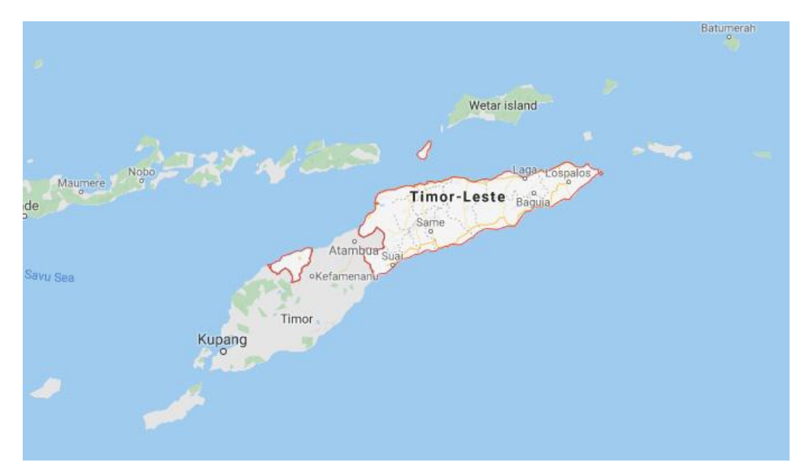
Figure 1. Timor Leste