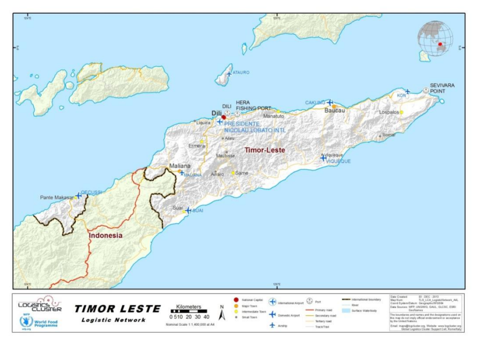
Figure 6. Timor Leste Air and Sea Transportation

Road vehicle types circulated in Tinmor Leste can be classified as follows. Vehicle types for passenger transportation are : motorcycle, tricycle, sedan, SUV, micro bus, medium bus, and standard bus. While vehicle type for freight are pick-up, light truck, mideum truck, and heavy truck. The semi trailer are operated only to transport the containers from Porto Dili to the ANSL container yard.