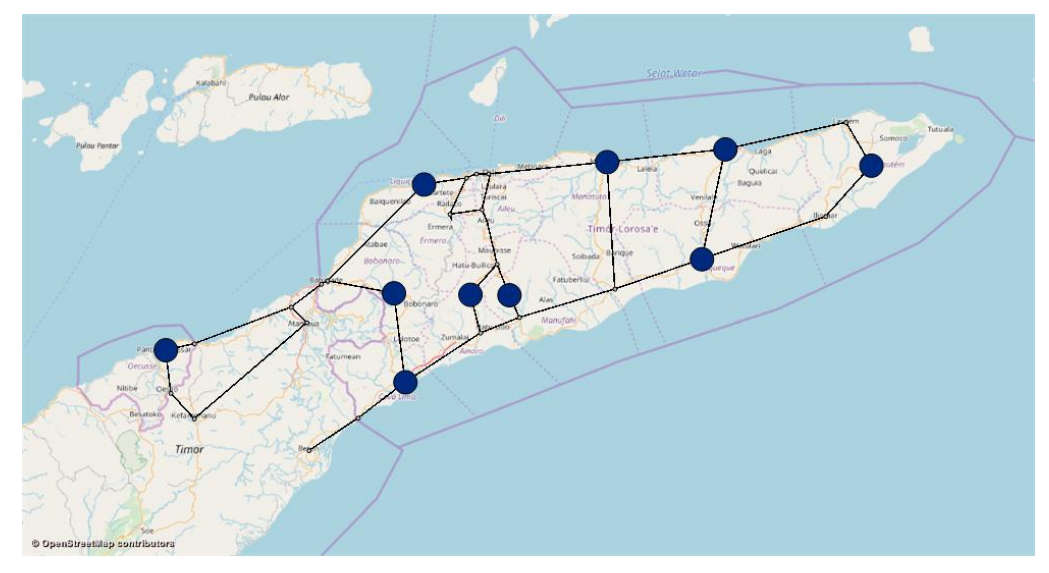
Figure 7. Road Network System Connectivity Model

For the purposes to assess the Connectivity Quality, the Road Network System Model can be developed as node connected by the straight links. The nodes represent the 16 National Center Activities above. The straight line links represent the national road segments connecting the nodes. The Road Network System is presented the Figure 1 below.