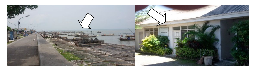
Figure 4. The base boat on shore and the economic enterprise office of Bulak Tinjang

"The quality of housing environment can be assessed in terms of physical and non physical. A settlement has good criterion, when the physical and non-physical aspects are fulfilled" (Sumartinah, 2000). The physical aspect can be reviewed on the geographical location, that the environment and infrastructure have built. While non physical aspects must be regards to the social, economic and cultural occupants. According to the Agenda 21 also emphasized that the expansion of settlements, which can improve the quality of life of its inhabitants. There are the concept of integration between social, functional and ecological. Characteristic of fishing village settlements in Kedung Cowek Bulak district, based on of physical and non-physical aspect, which is insaparable in creating housing environment quality. The settlement has been surrounded by social, economic and cultural blend until the settlement becomes functionally and ecologically (Figure 4).