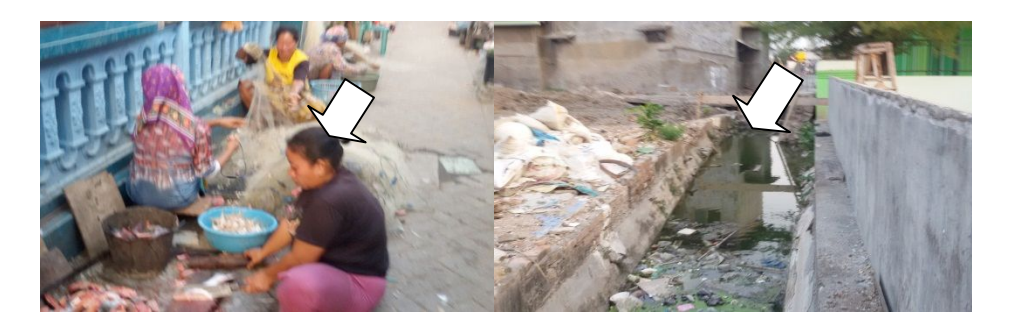
Figure 7. The bad condition in study areas location (Bulak district area)