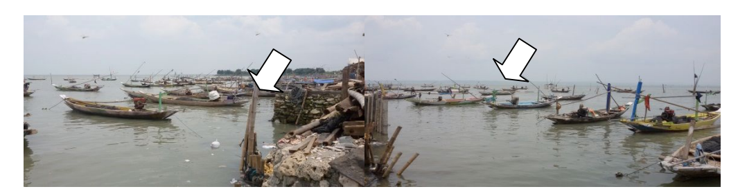
Figure 5. The base boat on site of Nambangan Perak and Bulak Tinjang fishing area

The mooring dock in Bulak Tinjang and Nambangan Perak, where the boat is not available in fishing area, all of them were parked on the shore with a harness strap tied with iron planted on beach. Sometimes when a big wave was come, then the boats washed away to the sea. This condition is extremely detrimental for the fishermen, because they should have boats through the cooperation enterprise in Bulak Tinjang. The base boat on site can be seen in Figure 5.