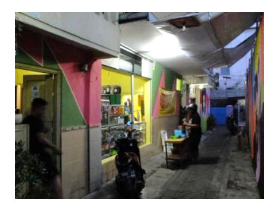
Figure 3. One of Home Based Enterprises at Kampung Kaliasin, Creating A Space by Adding Non-Permanent Tent to Cover the Alley