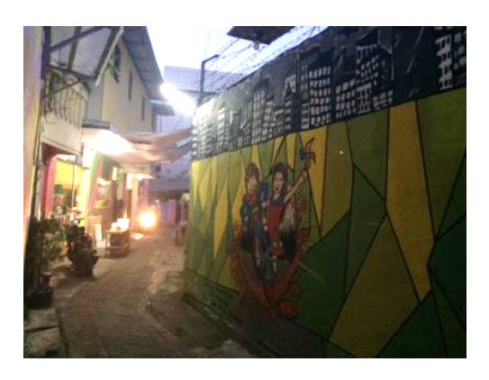
Figure 2. An Alley in Kampung Kaliasin