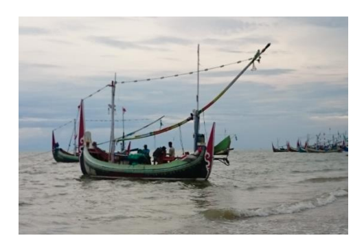
Figure 5. Ceremony of "Petik Laut" in 2014

tourists can enjoy the scenic beauty of the ocean and can fish in the middle of the sea (Figure 5).