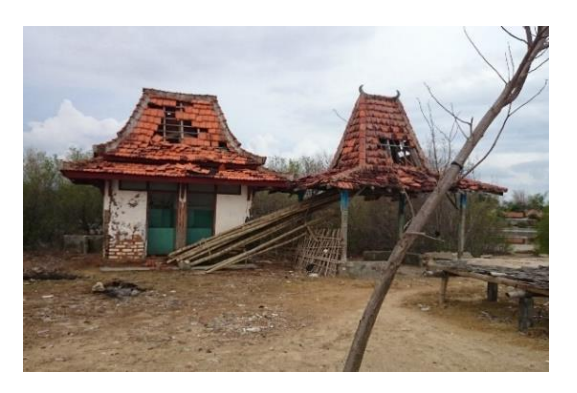
Figure 11. Sanitary Facilities that have been Damaged

This factor shows that the development of tourist attraction when combined with the development of tourism facilities, such as the provision of accommodation and tourist transport facilities, will be able to increase the attractiveness for the growing number of tourists and supports the development of a new tourist attraction. Optimal results can be achieved if development efforts are supported by the development of adequate infrastructure (Figure 11). An adequate infrastructure and tourism facilities will create a good conditions and ready to compete with other tourist destination outside Pamekasan.