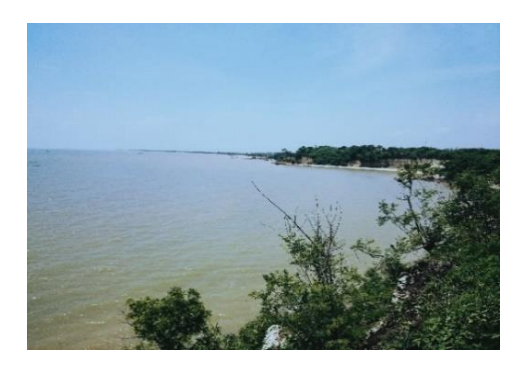
Figure 2. Jumiang Beach Natural Panorama from The Cliffs

1. Jumiang Beach Natural Panorama Jumiang Beach has a unique and different characteristic compared to other beaches in Pamekasan. This beach has steep cliffs on one side and sloping beach on the other side. On the sloping area, Jumiang Beach offers exotic landscapes of the vast sea with a direct view to the Madura Strait while on the top of the cliff, Jumiang Beach offers scenic and beautiful expanse of ocean with high cliffs on the east side and the rocks below the cliff (Figure 2).