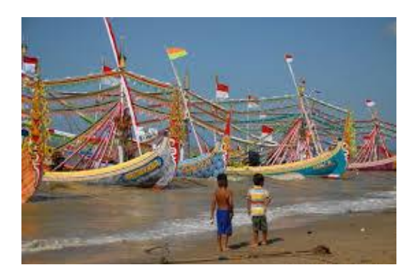
Figure 4. Ceremony of "Petik Laut" in 2014

Petik Laut is an expression of gratitude for livelihood and salvation given by God through the nature. This tradition is now used as cultural and traditional attraction of the fishermen community in Jumiang Beach Tourist Area and a means to explore the local potentials through local arts, various competitions, and traditional party with various entertainments (Figure 4).