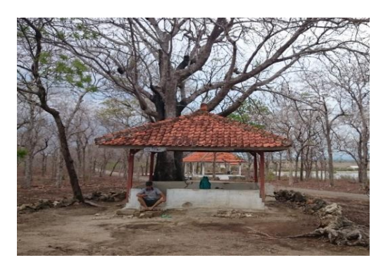
Figure 3. Historical Tomb of Buju' Adirasa

This tourism spot is unique because it has a historical heritage that adds another potential of this beach. The tomb gives us a historical value that during his lifetime, Adirasa liked to meditate to get closer to the Almighty and this of course will give another value for the tourists and local community. See the following Figure 3 to get more details about The Historical Tomb of Buju' Adirasa.