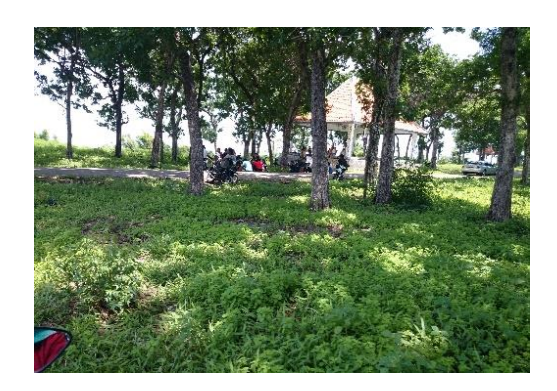
Figure 10. The Uniqueness of Jumiang Forest Hills and Corral Cliffs that can be Explored as Outbond Area