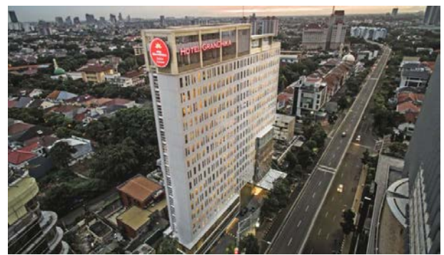
Figure 1: Research Sites (Hotel Grandhika Blok M)

The location is the choice of researchers because the Grandhika Hotel Blok M is the first hotel owned by BUMN Contractors works and new picnic in 2016. The location of this hotel was previously used as one of the division offices of PT. ADHI KARYA (Persero) Tbk which later developed into a hotel. In addition to the above above the ease of access to obtain data that is also a consideration of researchers chose the location.