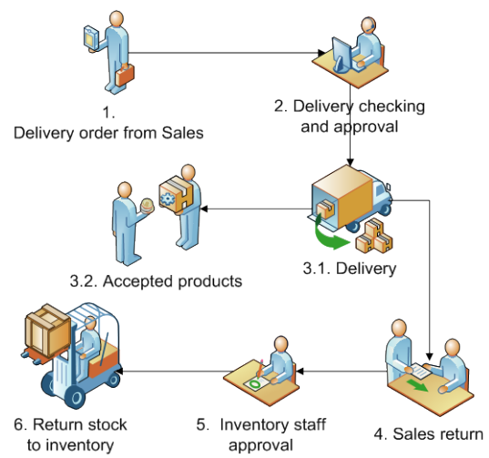
Figure 4. Delivery Process