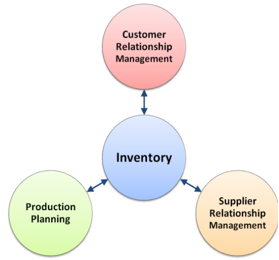
Figure 2. Relation between Inventory domain and Other Functional Domains in ERP