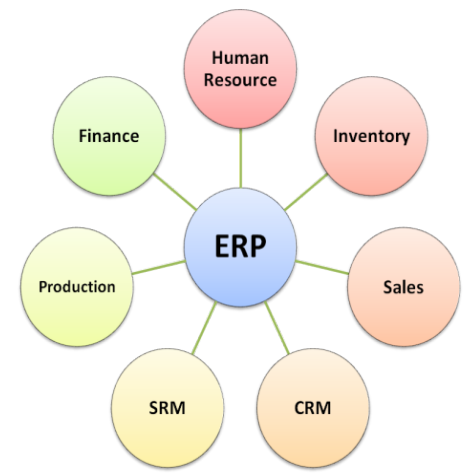
Figure 1. ERP Domains Integration Diagram