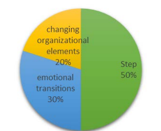
Figure 2. Grouping the Model based on the Main Focus

Expect that, there are two standards that related, i.e. COBIT 5 BAI05: Manage Organisational Change Enablement, seven phases of the COBIT Implementation Life Cycle dan ITIL continual service improvement approach[17]–[19].