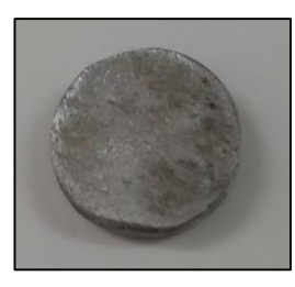
Figure 2. Visual Observation On Testing Specimens