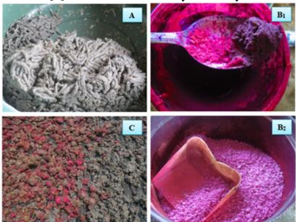
Figure 1. Paste of Petek fish and Rebon shrimp: (A) before added dye; (B<sub>1</sub>) powder Rhodamine-B; (B<sub>2</sub>) mixed salt and synthetic matter – 1 kg salt: 4 g dye; (C) the paste with and without the color.

cage. Insects — other animals and environmental condition disturbed the quality dried product. Tray dryer as modern drying was applied to overcome it [6], [7] and capable presented a hygiene shrimp paste — extended shelf life [8]. Rhodamine-B was synthetic dye that used