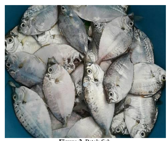
Figure 2. Petek fish..

mostly in milling process. The color remained in this device for long time and pierce. This was difficult to be cleaned until now. So, it added thick sample if the equipment was used over and over.