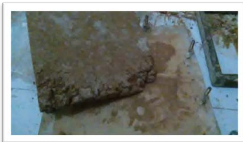
Figure. 2. Specimen Failure (50% PU,50% Sawdust)