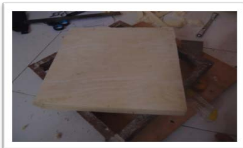
Figure. 1. Specimen 100% Polyurethane

Polyurethane composite specimens with 50% or by adding a mixture of sawdust 50% or smaller, polyurethane solution can not be spread evenly throughout the side and penetrated the sidelines of sawdust. So that the specimen is not perfect, easily damaged and sawdust easily detached due to lack of binder (polyurethane) as shown in Figure 2. Therefore, in this study the characteristics of thermo physical measurements can only be performed on a specimen of composite polyurethane sawdust 60% and 40%.