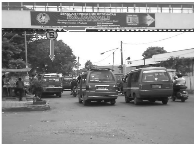
Fig. 2. Existing Traffic Conditions at Rajawali – Dadali Unsignalized Intersection.