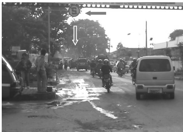
Fig. 4. Traffic Conditions with The Presence of Police officers at Rajawali-Dadali Unsignalized Intersection.