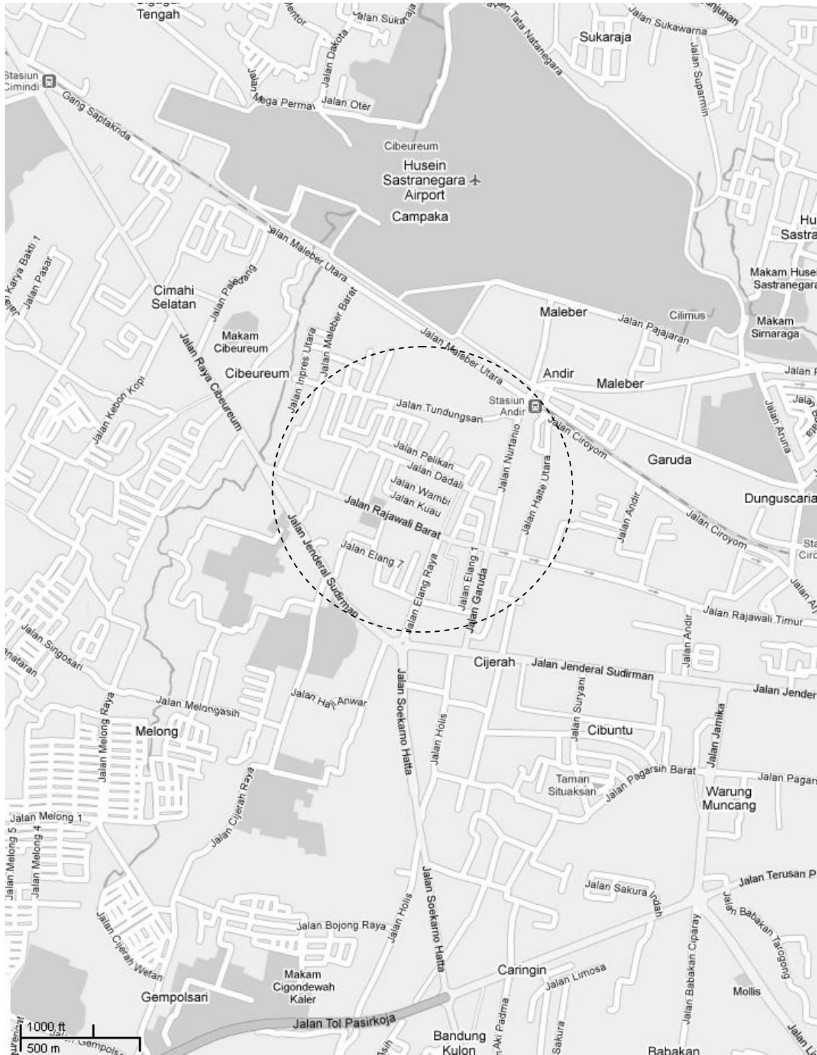
Fig. 1. The Location of Rajawali-Dadali Unsignalized Intersection in Bandung, Indonesia. 13