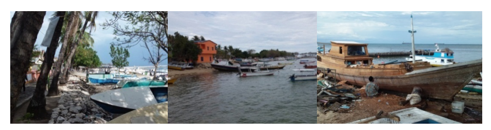
Figure 8. Social Life and Culture Tourism

In another part of the island, there is a Japanese cave which according to citizens' information was a Japanese relic cave, providing a passage to the mainland of Makassar city. But the condition of the cave is very poor, as it was used as a garbage dump by the local people. These items can be developed for heritage tourism. The illustration of social life and culture tourism can be seen in figure 8, while the nature tourism can be seen in figure 9.