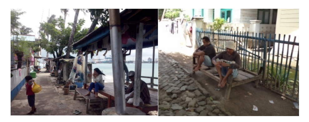
Figure 2. Communal Space Created by the Street Side

The beach area is a communal space that is used as a parking lot for boats, manufacture and maintenance of boats / ships, for play, to socialize, for exercise, recreation, and even control the environment that might be affected by newcomers. There are several bale-bale in the area, almost all of them placed near the trees to get shade and fresh air. The illustration of communal space in Lae-lae island can be seen in Figure 2.