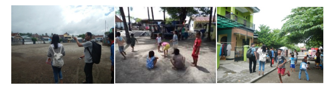
Figure 3. Football Field and Green Open Spaces