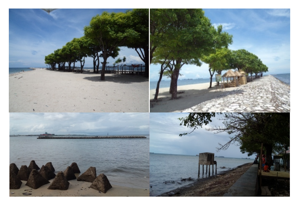
Figure 4. Sea Wall Which Developed into a Recreational Beach and the Row of Tammamate Trees

Currently, there are tourist attractions which are north of the island. Originally the area was a seawall intended for the protection of the Makassar city from the surf. Over the years, the west area of the seawall has experienced sedimentation and developed into the beach and is currently visited by many residents for recreation. There are several buildings made of bamboo lining the place and used by tourists for resting. Similarly, the row of tammamate trees / Jawa-jawa are giving shade and a comfortable atmosphere in the area. The illustration of sea wall which had been developed and the row of tammamate trees can be seen in Figure 4.