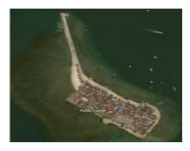
Figure 1. Lae-Lae Island

In their daily life, people on the island of Lae-Lae spend more time in open spaces. Various activities do not take place in the house but in the yard, the street, beaches, and other open places. Diverse activities are conducted in these places, where there are playing, working, resting, eating, parenting, or just socializing with neighbors. In these places, they put bale-bale as seats and the placement is generally under the big tree.