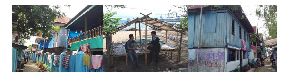
Figure 9. Nature Tourism

The Japanese cave has historical value. Based on research conducted by PATA in 1961 in North America, for more than 50% of foreign tourists who visit the Asia and Pacific regions, the motivation of their travel is to look and see the customs, the way of life, historical heritage, ancient buildings and buildings of high value. According to the study Tourism Citra Indonesia in 2003, cultural tourism is the element that most attracts foreign tourists to come to Indonesia. Getting a score of 42.33 foreign tourists placed culture in the category of 'very interesting' and on top of other elements such as natural beauty and historical heritage, with a score of 39.42 and 30.86 respectively. This demonstrates cultural attractions as the most favored by tourists from tourism in Indonesia. Therefore, the condition of this Japanese cave needs to be re-organized to make it more attractive