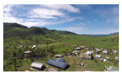
Figure 3. Nokonoko Village Damage