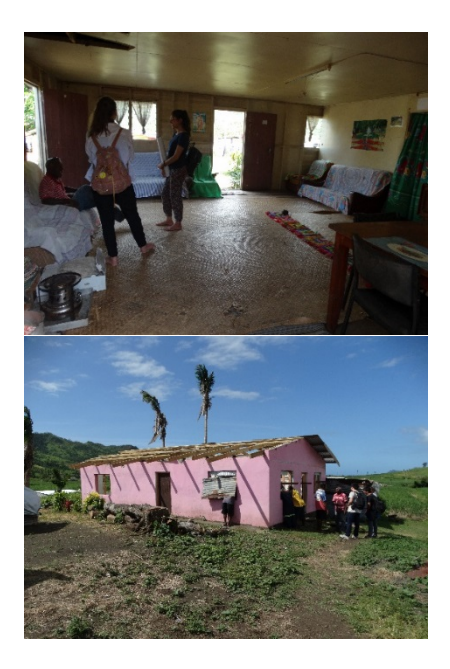
Figure 4. Nokonoko Village Resilience