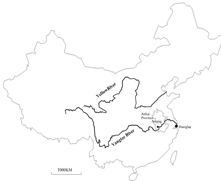
Figure 1. Anqing City in China

The city of Anqing lies on the north bank of the mid-lower reaches of the Yangtze River in the southwest of Anhui province (see Figure 1). At the end of 2014, the city of Anqing covered an urban area accounting for 81km 2 and urban residents of 808,000 (SBAP, 2015).