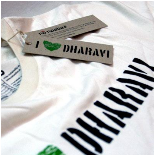
Figure 5. Products of Reality Gives

Behind the enormous success of these touristic activities, not everyone was satisfied with the improved situation in Dharavi. Just after the movie’s release, a major debate emerged between those who argued that slum tours turn poverty into entertainment and those who saw the tours’ contribution to the local economy. Consequently, reality tourism obtained several names, such as poorism and poverty tourism , and became the centre of several conflicts (Selinger and Outterson, 2009).