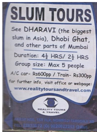
Figure 6. Slum Tours Poster in Central Colaba Source: Dharavi documenting informalities, 2008

The stories presented in this paper are intended to offer an insight into how and why Dharavi emerged as a spectacle but also to assess the possibilities that slum tours might offer to the evolution of a place. In a crucial moment for Dharavi’s urban future as a slum, the tourism’s emergence slowly built up influence against the