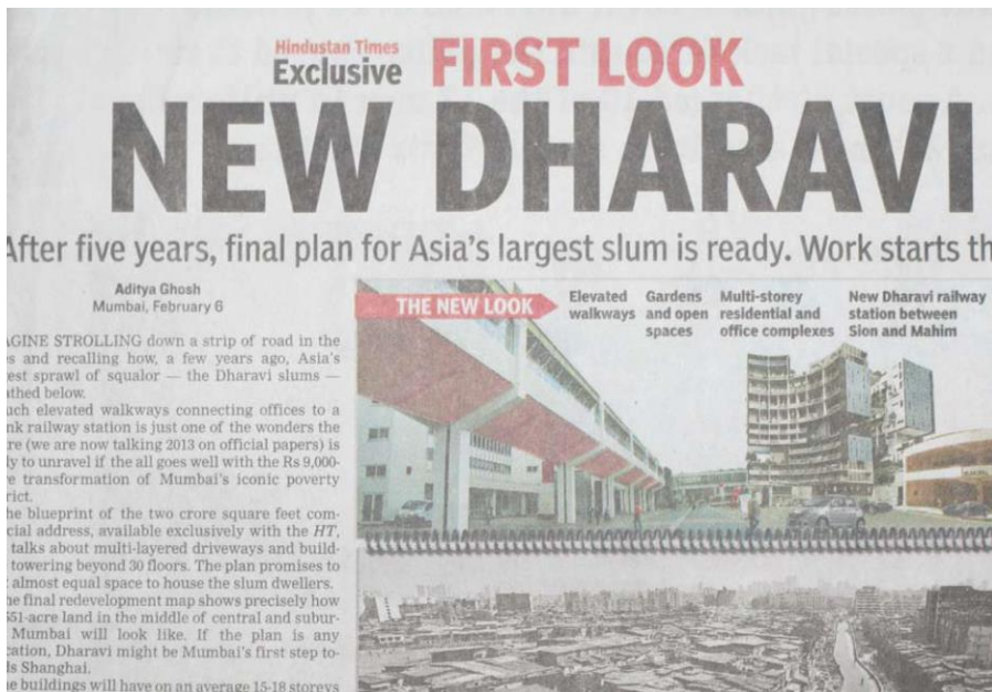
Figure 4. Dharavi Redevelopment Project

The immense interest in Dharavi's territory has corresponded with a series of redevelopment plans since Dharavi was officially recognised as a slum in 1976. This model of housing delivery has not been successful in the past and various hurdles have resulted in the delay of any top-down transformations. This section explores the latest attempt to redevelop Dharavi parallel to the emergence and development of Dharavi slum tours.