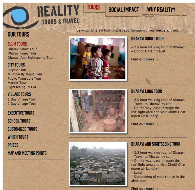
Figure 3. Reality Tours Web

The governmental attempts to eradicate Dharavi's identity as a slum, together with any parallel touristic activities that promote this slum character, bring into question Dharavi's position in the urban future of the city.