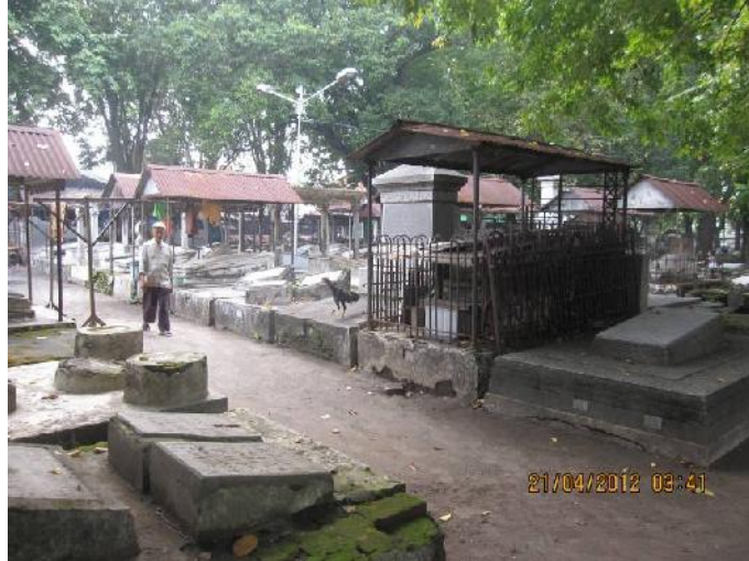
Figure 4. View on the Desolate Condition of the Graveyard and the Greenery of Big Trees