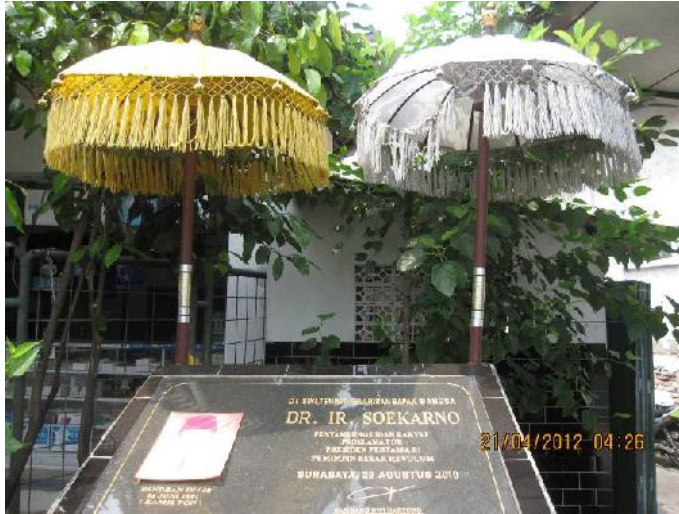
Figure 3. Plaque Indicating the House Soekarno was Born

From an architectural point of view many building structures in Peneleh can be classified as kampung art deco, adding to the special features of the kampung . Still there is a great variety in architectural style culminating in the eclectic style of Ons Hoekje , our little corner, near the entrance of the cemetery showing the Dutch relation.