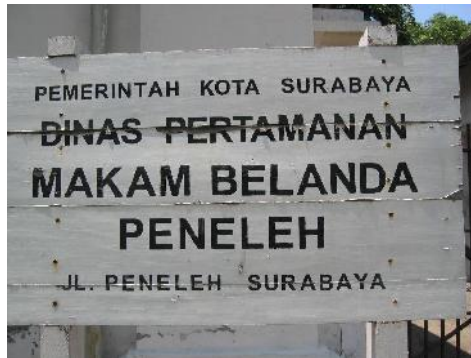
Figure 1. Signboard at Main Entrance

In the very centre of the build-up area of Surabaya, the second largest city of Indonesia, the Makam Belanda , Dutch graveyard, is located amidst a densely populated kampung Peneleh. While this cemetery was established in 1847 since 1917 it was already out of operation after it was considered fully occupied. From that time new graves were not added but burials in existing family graves were still possible. Originally the Peneleh graveyard was situated outside the old city centre as the government bought new land in the swampy area. The condition was not favourable for a cemetery but before it opened the selected plot was raised with sand and drained from superfluous water. A special road was constructed to connect the graveyard with the city and a bridge was built. This Kerkhoflaan (Graveyard road) is now the Jalan Makam Peneleh and the bridge is still there. Soon after the graveyard was established at the location the kampung Peneleh gradually surrounded the area by moving in the swampy grounds around it. The signboard of Peneleh Graveyard is shown in Figure 1.