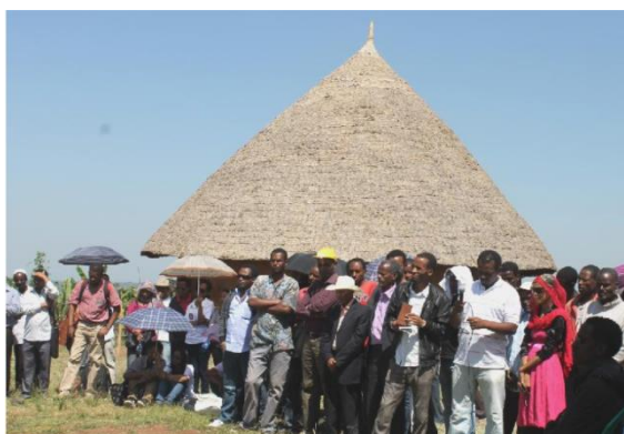
Figure 4. Local People and Dignitaries Attend The Inauguration of SRDU II

In September 2011, a small event was organised whereby each of the trainees received three different-sized metal moulds for block making and an illustrated manual in the local Amharic language which describes the construction process step-by-step. This was to encourage the trainees to begin implementing what they had learnt. It was suggested they try to construct a modest structure in their localities using the SRDU building materials and construction techniques. At this early stage emphasis was not put in replicating the SRDU in its totality, but rather consolidating what had already been learnt. The response of the trainees was encouraging: within a period of six months, four trainees managed to produce hundreds of soil blocks while one of them constructed an outdoor toilet using the SRDU technique. This was the first milestone in the process of scaling-up and it indicated that the trainees had taken the idea of the research seriously and were committed to taking it forward.