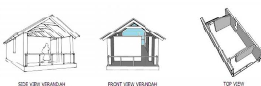
Figure 4. The Gabion House Green Concept

The overall cost of constructing a 9x4.8 metre gabion house (as shown in Figure 4 above) in December 2010 was US$3964.50 (US$92/m 2 ) (see Table 1). This would be less depending on labour costs, proximity of rubble, and size and amenities included in the house. Typical costs for other new houses were in the US$170-200/m 2 and therefore the gabion concept was an economic housing option.