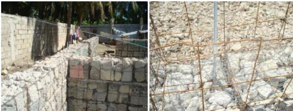
Figure 3. Gabion House 1 Walls Under Construction.

A gabion is a wire cage (Geiger, 2012) into which are placed rocks that are stacked vertically to form retaining walls. In this case they were designed for housing (Temporality 109, 2012), (Mulligan, 2012), (Enviromesh, 2008). The cages were lined with chicken mesh and the rock material selectively placed and compacted into the cage and topped with smaller aggregate material (see Figure 3). The cage sizes were typically 600mm long by 300mm high and 300mm wide. They were laid in a stretcher bond, wired together both vertically and horizontally with the gabion tops open to enhance interlock between layers (Brennan, 2011).