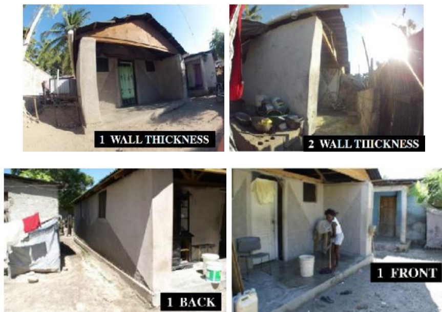
Figure 6. A Sense of The Gabion House's Comparative Dimensional Size to The Usual Houses.

Comments from the full interviews were noted in each of the framework characteristics and matches and mismatches identified. In the “match up area” it seemed that the major value adding component was via value integration. The perception amongst all of the households was that the gabion house felt safer, offered better protection and security and was stronger than other existing houses or new houses provided as part of the earthquake response they had visited. This largely seemed because of the extent and thickness of the gabion units at around 400+mm thick once they were plastered from their original 300mm. This can be felt in the photographs in Figure 6 below. This had not been expected by the original Green Concept team (which the author had been a member) but it was nonetheless, pleasantly surprising. Interestingly, the thickness created “unintentional” transitional spaces at doors and window reveals.