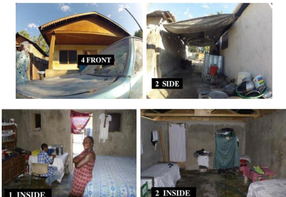
Figure 7. In and Around The Gabion Houses.

The other aspects of the Value Adding Framework of knowledge and process integration and timely decision making were minor though the process integration and timely decision making related to house additions was apparently prevented for the first 3 years. Despite that house occupants had installed “kitchens” which can be seen in the photographs of Figure 6 (refer to “1 Back”: kitchen can be seen in the back of the house; “2Wall Thickness”: kitchen on the side of the house). What is interesting about both is that the wall thickness allows hot kitchens to be placed directly against them. This can be done against concrete block for example but would quickly lead to degrading of the low quality blocks commonly used and perhaps a more slower one for quality one.