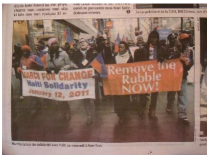
Figure 2. Rubble was A Political Issue One Year after The Earthquake.

One major obstacle was the rubble generated by the extensive building collapses in the ravines and hill sides that blocked the maze of alleyways and lanes. Early estimates put it at around 20 million cubic metres with later more accurate measurements placing it at around 10-11 million (BBC, 2011). But even that lower figure represented 27.4 years of local production with all 3 quarries working 24/7. Moreover, the cost of mechanically clearing and dumping the rubble was estimated at between US$32.50-$58 per cubic yard (New York Times, 2010) by one source and US$26-$80/tonne by a second source (SKAT,2000) with a cost of between