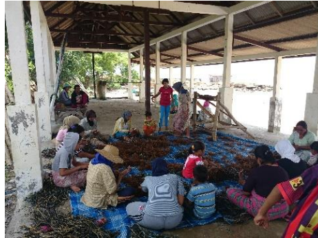
Figure 9. Sea Grass Cultivation Activity which can Support Tourism Activities

Participation of local community is a kind of inputs in the development of coastal tourism. Through the participation of local community, they are expected to be able to develop existing activities in order to support tourism activities in Jumiang Beach and provided services and convenience for tourism activities. Consequently, tourism activity can provide direct benefits to local people and tourists want to stay long enough in Jumiang Beach Tourist Area.