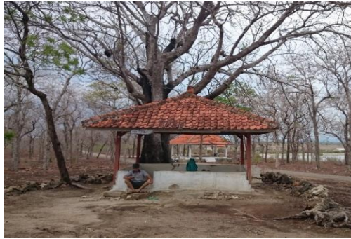
Figure 3. Historical Tomb of Buju' Adirasa

This tourism spot is unique because it has a historical heritage that adds another potential of this beach. The tomb gives us a historical value that during his lifetime, Adirasa liked to meditate to get closer to the Almighty and this of course will give another value for the tourists and local community. See the following Figure 3 to get more details about The Historical Tomb of Buju' Adirasa.