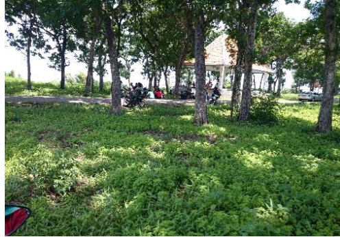
Figure 10. The Uniqueness of Jumiang Forest Hills and Corral Cliffs that can be Explored as Outbond Area Source: field survey, 2015