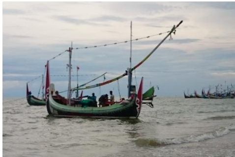
Figure 5. Ceremony of “Petik Laut” in 2014

tourists can enjoy the scenic beauty of the ocean and can fish in the middle of the sea (Figure 5).