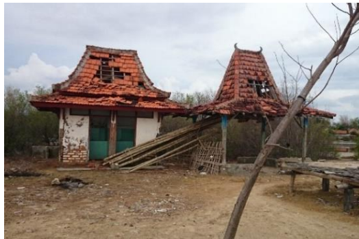
Figure 11. Sanitary Facilities that have been Damaged

This factor shows that the development of tourist attraction when combined with the development of tourism facilities, such as the provision of accommodation and tourist transport facilities, will be able to increase the attractiveness for the growing number of tourists and supports the development of a new tourist attraction. Optimal results can be achieved if development efforts are supported by the development of adequate infrastructure (Figure 11). An adequate infrastructure and tourism facilities will create a good conditions and ready to compete with other tourist destination outside Pamekasan.