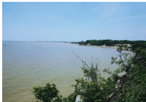
Figure 2. Jumiang Beach Natural Panorama from The Cliffs

Jumiang Beach has a unique and different characteristic compared to other beaches in Pamekasan. This beach has steep cliffs on one side and sloping beach on the other side. On the sloping area, Jumiang Beach offers exotic landscapes of the vast sea with a direct view to the Madura Strait while on the top of the cliff, Jumiang Beach offers scenic and beautiful expanse of ocean with high cliffs on the east side and the rocks below the cliff (Figure 2).