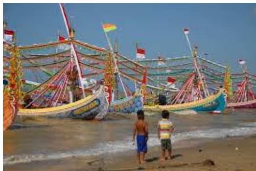
Figure 4. Ceremony of "Petik Laut" in 2014

Petik Laut is an expression of gratitude for livelihood and salvation given by God through the nature. This tradition is now used as cultural and traditional attraction of the fishermen community in Jumiang Beach Tourist Area and a means to explore the local potentials through local arts, various competitions, and traditional party with various entertainments (Figure 4).