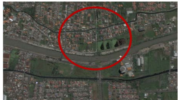
Figure 1. Medokan Semampir land area in 2002

encountering significant land use change. A previous study by Surabaya planning agency in 2009 states that the land traced by MERR road which was originally supposed to be an area for settlement and agricultural only now has deviated. Before the existence of MERR road, land use that occupied by settlement area approximately 126.278,32 m 2 , while the agricultural land covers 654.100,19 m 2 which spread in the various area. However, in 2014, the land use that dominated by agriculture area before changed into a road network system, commercial and public facilities use. This sudden transformation supports by a location factors wherein since MERR road was built the surrounding area becomes more strategic than before. MERR road provides society with a very easy access to urban mobility. Those changes happened in Medokan Semampir district as well. The illustration of Medokan Semampir area transformation can be seen in the picture below.