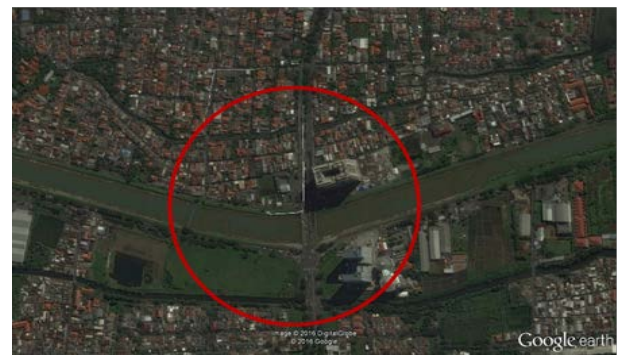
Figure 3. Medokan Semampir land area in 2014

MERR road construction has been processed. At that time, MERR road was connecting separated land by the river. Settlements began to concentrates near the road