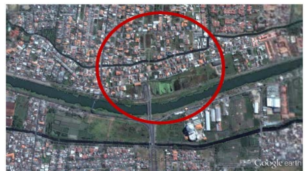
Figure 2. Medokan Semampir land area in 2009

MERR road has not been built. The land of Medokan Semampir occupied by settlements in general.