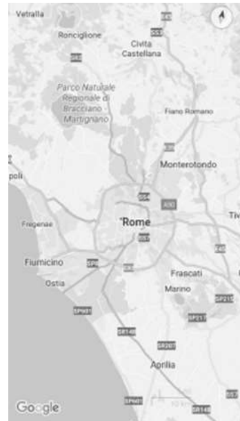
Fig. 1 Rome's Morphological from The Satellite

Grid pattern was used in ancient Roman period. The first road built was the Capitol Hill which connected Rome to its empire. Nowadays the structure of Rome is circled at a distance of about 6 miles from the capitol, by the ring-road. Rome had spaned for more than two and a half thousand years, starting from 753 B.C, causing inhabitant and settlements to grew fast. This city become the most populated comune and the fourth most populated city in the European Union. Since the settlers are in tremendous number, the governor has to provided road which connects the settlements to the central business distric. Furthermore, the city also provided access that integrated the historical sites due to the increase number of tourists. To simplify the comute, Rome has a massive transportation mode such as main railway station or Termini. The transportation mode is known for the most heavily used in Italy, around 400 thousand travellers passing through everyday, making Rome much easier to be reached from anywhere.