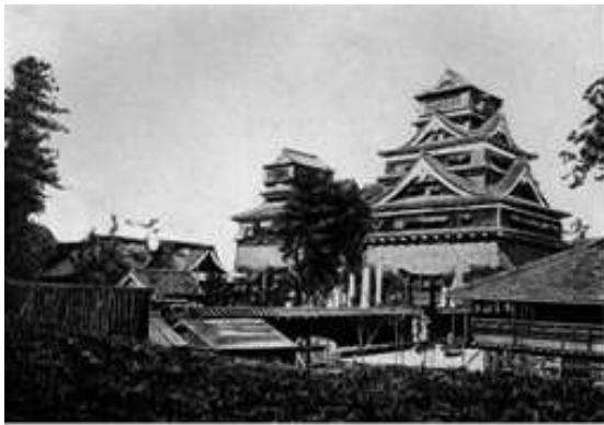
Fig. 3 Japan under the Shogun

Tokugawa Shogunate ended and imperial rule was restored. The Emperor moved to Edo, which was renamed Tokyo. Thus, Tokyo became the capital of Japan. Then, during the Taisho era (1912-1926), the number of people working in cities increased, and a growing proportion of citizens began to lead consumer lifestyles. Performing arts such as theater and opera thrived.