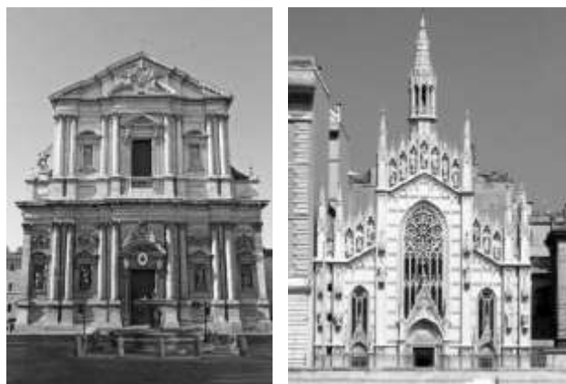
Fig.2 Symmetrical Architecture Buildings : Sant' Andrea (Left) and Sacro Cuore del Suffragio (Right).

The history of Tokyo started 400 years ago. Originally named Edo, the city started to flourish after Tokugawa Ieyasu established the Tokugawa Shogunate here in 1603. Edo grew into a huge city with a population of over a million by the mid-eighteenth century as it was the center of politics and culture in Japan. The Edo Period lasted for nearly 260 years until Meiji Restoration in 1868, when