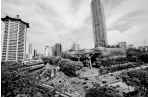
Fig.8 Buildings along Orchard Road, set back from the road street edge.