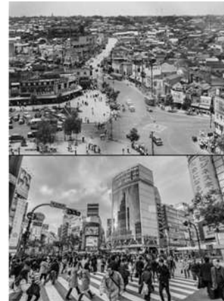
Fig. 4 Shibuya Crossing in Tokyo then (above) and present (below)

In the 1980s, Tokyo took large steps in economic growth as a result of its increasingly global economic activity and the emergence of the information society. Tokyo became one of the world's most active major cities, boasting attractions such as cutting-edge technology, information, culture, and fashion, as well as a high level of public safety. From 1986 onwards, land and stock prices spiraled upwards, a phenomenon known as the "bubble economy."