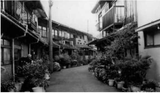
Fig.6 Machiya and Nagaya, Kyoto