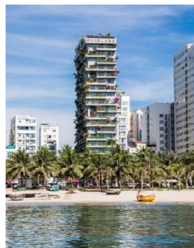
Figure 4. Chicland Hotel.

or utility management; 5) Aspects of space, including zoning, spatial planning, and functions [7].