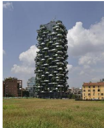
Figure 3. Bosco Verticale.

There are various ways that are carried out from an ecological approach to architectural planning, but in general have the same core, design principles with an ecological approach, according to Syarapudin’s research, among others; 1) Solutions grow from the place; 2) Design with nature; 3) Minimize energy and material usage; 4) Harmonizing the relationship between culture and nature 5) Maintaining environmental aspects such as soil, plants, and so on [7]. In addition to some of the above, Titisari and Hui also explained in Syarapudin’s research there are several aspects to the ecological approach, namely; 1) Aspects of structure and construction; 2) Aspects of building materials; 3) Aspects of energy sources and their use in daily life; 4) Aspects of waste