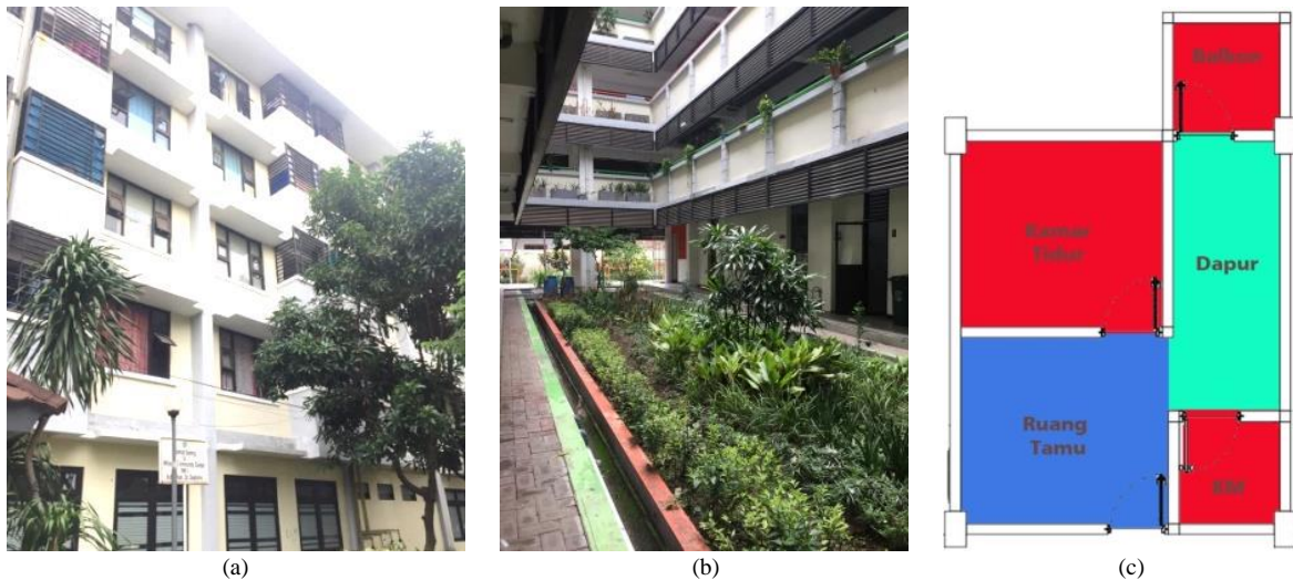
Figure 1. (a) Facade; (b) Internal Space Grudo Flat; (c) Fixed Plan Unit Grudo.