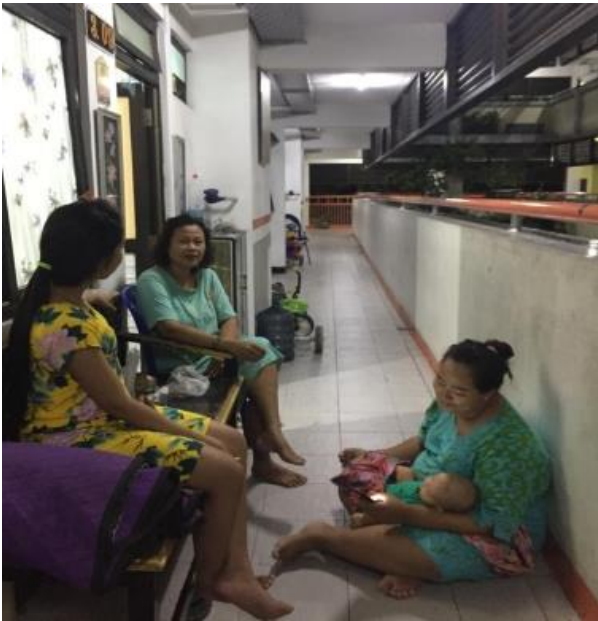
Figure 10. Domestic activities caring for children in communal spaces by housewives on the 4th floor.

Abbaszadeh (2015) regarding the determination of the theory using Threshold supply, it can be implemented by providing facilities at the entrance in the form of a fence or guard post. Design the front gate by presenting the concept of personalized residents. Figure 4(a), Figure 4(b), and Figure 4(c) show the facilities gate, security post, and entrance, respectively.