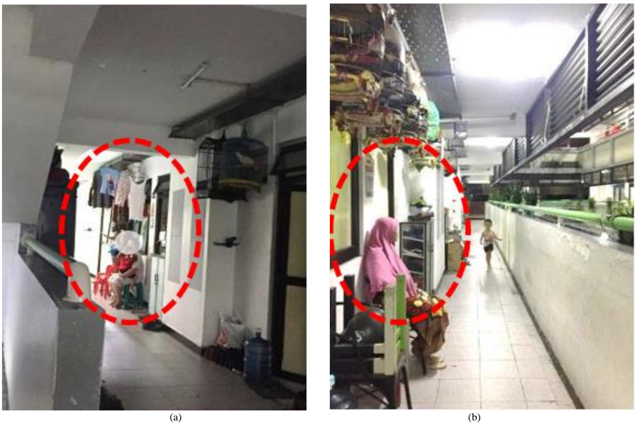
Figure 5. (a) The corridor room in front of the F; (b) The corridor room in front of the G participant units.

everyone will have their own ways that are adapted to certain culture to regulate their privacy (Altman, 1980).