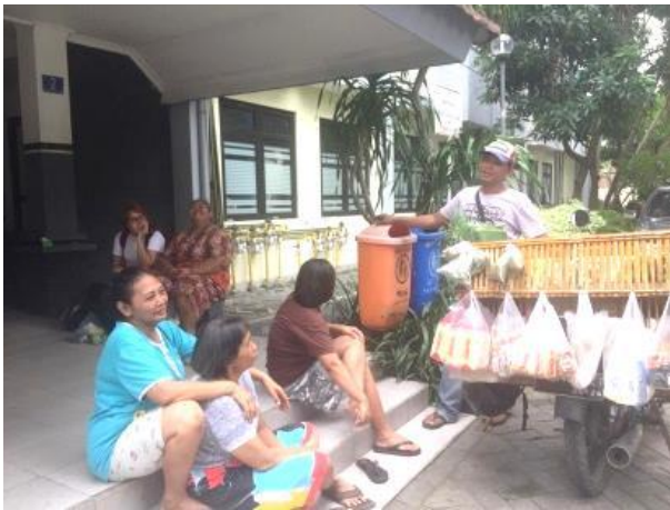
Figure 2. Activities of Housewives in The Grudo Flats in The Morning in The First Floor Communal Room.