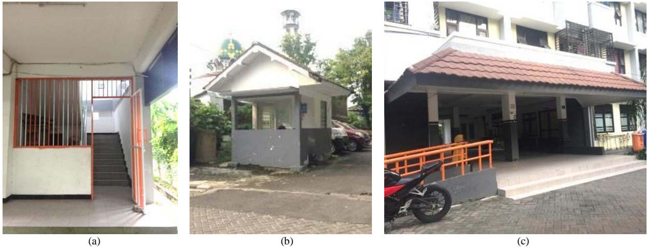
Figure 4. (a) Facilities Gate; (b) Security Post; (c) Entrance.