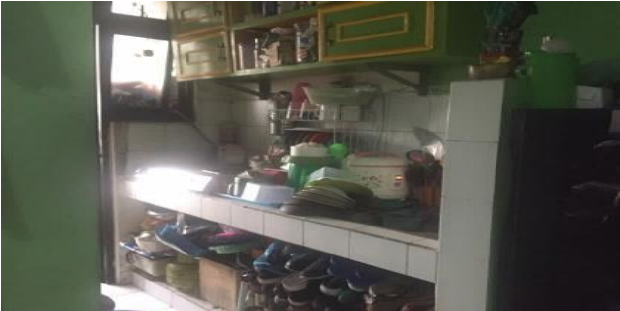
Figure 6. Storage of goods in the kitchen of the participant unit F.