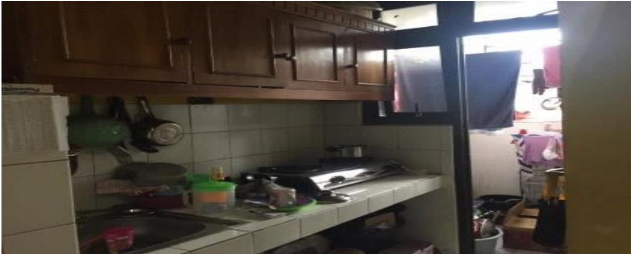
Figure 8. Kitchen Unit Participant J.