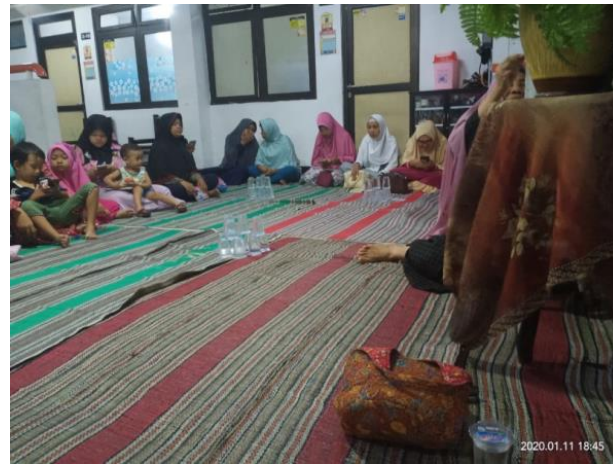
Figure 3. Religious Activities Communally in The Grudo Flat.

environment, as well as aspects of the reciprocal relationship between the two. Privacy is one of the results of the process of interaction between humans and their environment.