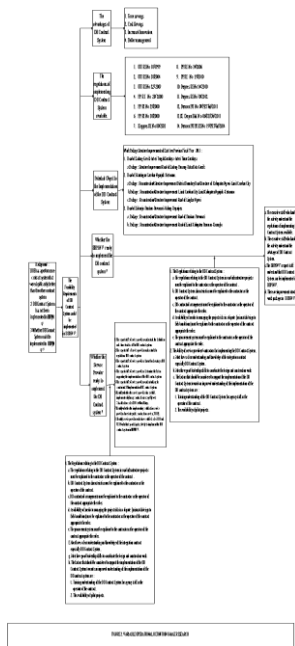
Figure 2. Variable operational definition.

The result flowchart were shown in the figure 2.