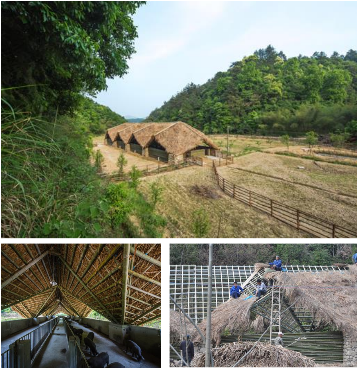
Fig. 2. Sun Commune, Hangzhou (2014) | Atelier Chen Haoru.