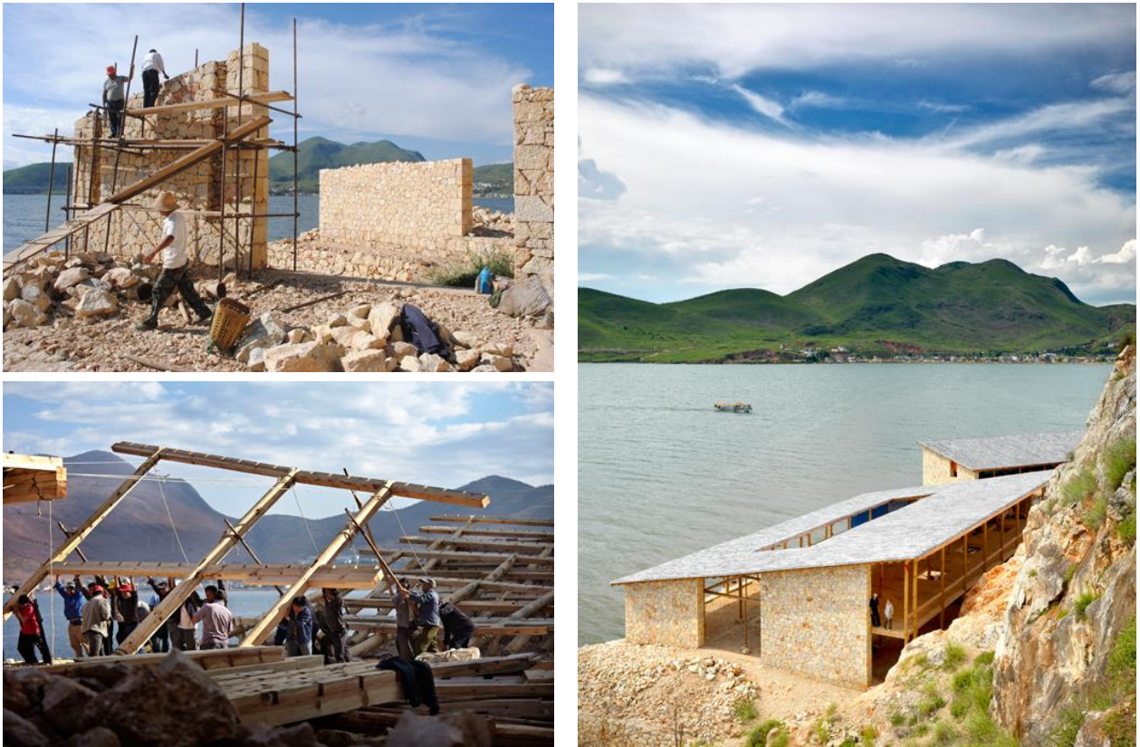
Fig. 4. Shuangzi Guesthouse, Dali (2015) | ZhaoYang Architects.

The Shuangzi Guesthouse project by ZhaoYang Architects is located in Dali, in the subtropical and mountainous South province of Yunnan, China. This young independent architectural office is special in terms of locale - away from China's big-city development - and its method of working, a mix of inspiring internationalism and distinct local features. In their manifesto - entitled 'ARCHITECTURE OF CIRCUMSTANCES', the architects state: "originality comes from circumstances, not ideas. Circumstance never recur. They form the river of Heraclitus." 16 The Shuangzi Guest House at first, upon construction, was met with suspicion. "Originally," so says Zhao Yang (b. 1980), "the local people thoughts strangely about our design; but its construction method happens to be very familiar to them. They understand the material, the combination of limestone walls and wood structure. It is their life." 17