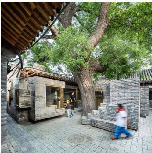
Fig. 3. Cha'er Hutong 8, Beijing (2014) | ZAO/standardarchitecture.