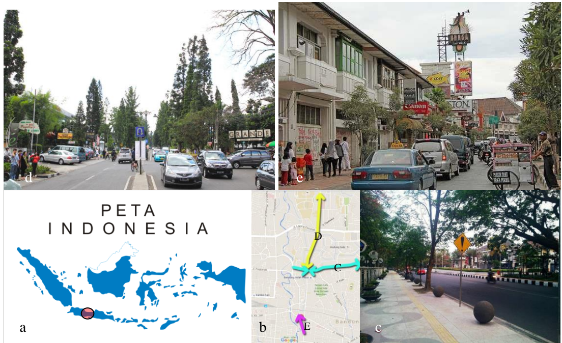
Figure 2. (a) Location of Bandung in Indonesia Map; (b) Location of Favorite Street in Bandung Map; (c) RE Martadinata Street; (d) Ir. H. Juanda Street; (e) Braga Street