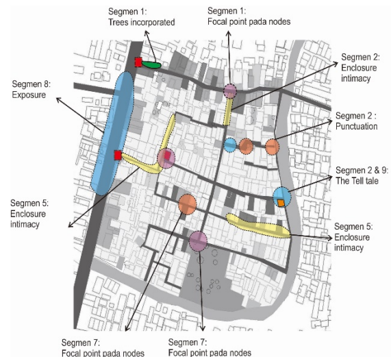
Figure 2. Potential points of Kampung Batik Jetis

Based on respondent's analysis, the result is combine by the physical value in researcher's point of view. Following linear side view and serial view techniques on 9 segments of observation, it was found that there were some visual qualities to be potential on the site, as well as some low visual and spatial qualities but still reinforced by strengthening in physical aspects. The results of the visual and spatial quality readings of this area are summarized in the following analysis conclusions