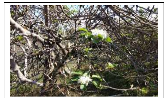
Figure 5. Apple plants that have been harvested and are growing new shoots