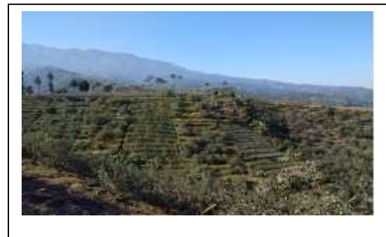
Figure 3. Agricultural Land Condition with Guluds

A form of farmers' adaptation to the topography of agricultural land with a slope of 40-50% was the making of terraces on their agricultural land. On land planted with apples, farmers made bench terraces, so soil erosion or landslides did not occur. Their choice of soil conservation techniques was the bench terrace. The terrace was planted with grass ( gajah or setria ) on the lips and cliffs to make the terrace building solid. While prevention soil erosion or landslides, they also made bench terraces and protected their investment in apple crops. Because by making a bench terrace, soil would be prevented from planting eroded apples. If eroded, then the apple plant would fall and eventually it would be damaged. Making bench terraces on land planted with apples, completed with creating water drainage (SPA). This was particularly important during the rainy season, so that the surface water flow on the top of the land did not erode the soil either on the bottom of the land or the canal itself.