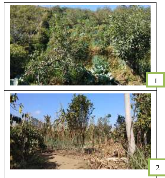
Figure 4. Intercropping system applied by GubugKlakah Farmers were: (1) Intercropping of Apple-Leeks-Cabbage; and (2) Intercropping of Orange-Corn-Leeks

People of GubugKlakah Village mostly worked as farmers, but off-farm work was also done if it was not suitable for planting. The majority of rain-fed agricultural lands were not planted during the dry season, so farmers had no income. Becoming a construction worker was their strategy.