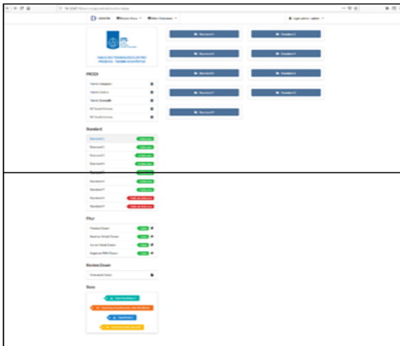
Figure 7. Main Page Display.