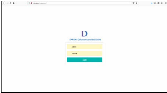
Figure 6. Login Page Display.