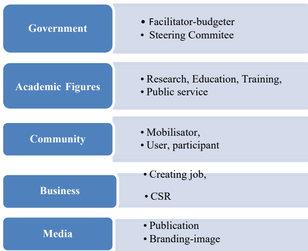
Figure 3. The Role of Pentahelix Stakeholders.