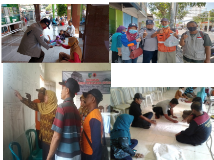
Figure 4. Learning and working with disaster risk reduction community in Kediri and Batu City (Source: Researcher documentation, 2020).

risk reduction. This collaboration pattern involves the main actors (BPBD-Disaster Volunteer Community, Village Alert Team) in disaster management. Through collaborative practices, it is expected to produce productive synergy. The following Figure 3 is a description of the pentahelix stakeholder involvement in the Forum of Disaster Risk Reduction-East Java.