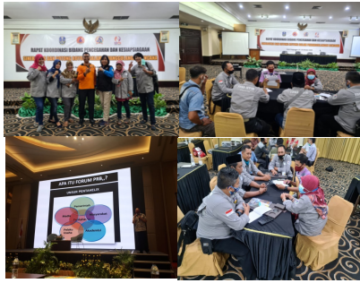
Figure 2. Practice of a Collaborative-Pentahelix approach: FGD and coordination of FDRR-East Java committee in Singgasana Hotel, November 20 th -21 st 2020.

disaster management and has a joint commitment in developing a synergistic strategy for disaster risk reduction in the East Java region. These strategies and approaches can work optimally if they are carried out with the synergy of multi-stakeholder collaboratively and continuously.